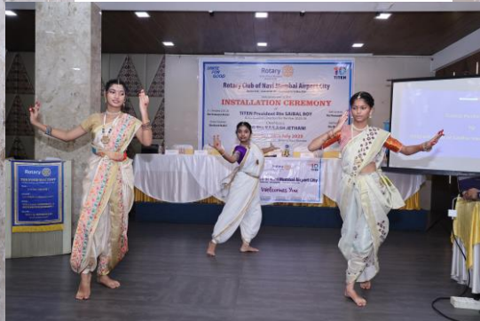
Performance by Interact Club Sadhu Vaswani Junior College