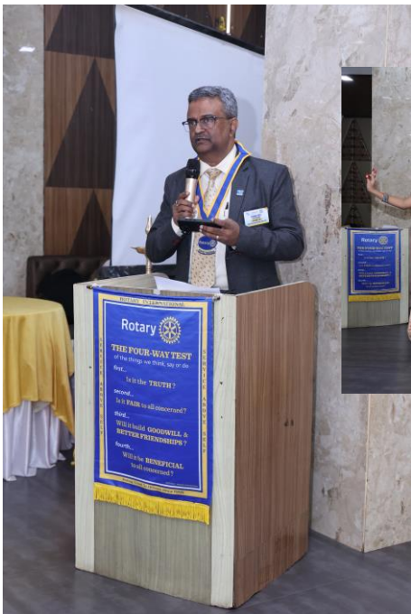
Inaugural speech by President