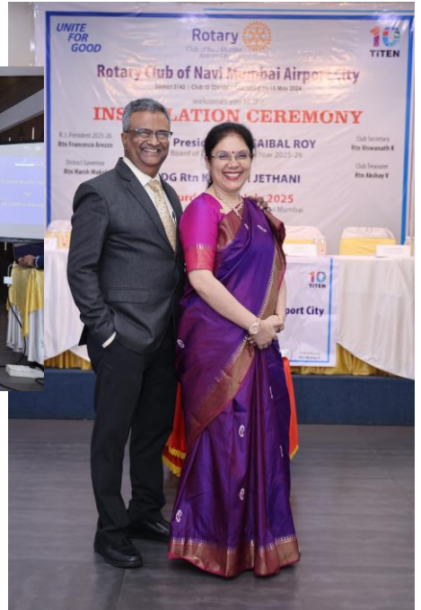
President & First Lady