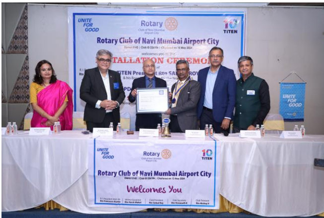
Handing over of the Club Charter Certificate